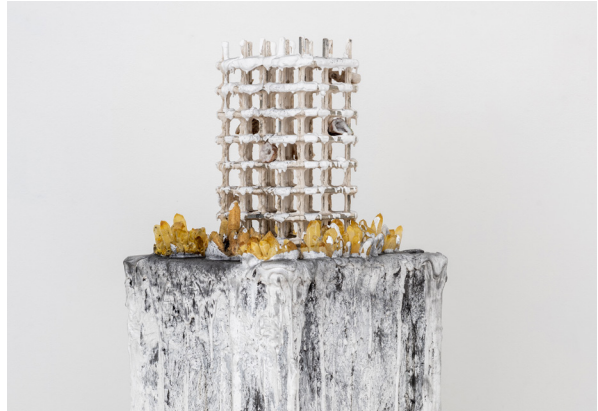
© Aida Mahmudova, Untitled, detail, 2022.