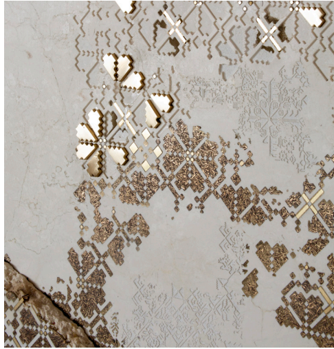
© Naqsh Collective, A Story of Our Lives In a Thobe , work in progress, 2023.