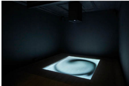
Ben Tricklebank Ender-Reflection Pool , 2016 Gazelli Art House

“Ender,” Ben Tricklebank’s new show at Gazelli Art House in London, takes its title from the type of device that serves as both an encoder and a decoder—hence the portmanteau—on a signal or data stream. Fittingly, Tricklebank’s solo show, his first in the UK, explores our developing and sometimes fraught relationship with technology.