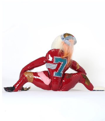
From Left: (all) Gray Wielebinski Sliding Into Home , Wooden baseball bat, sewn leather, fur, baseball cards, jock straps, jersey, 2018. Denim Curtain , Denim, leather, baseball cards, fabric, with champagne glass installation, 2018 Hook , Mixed media soft sculpture (leather, fur, jersey, crocodile hand), 2018