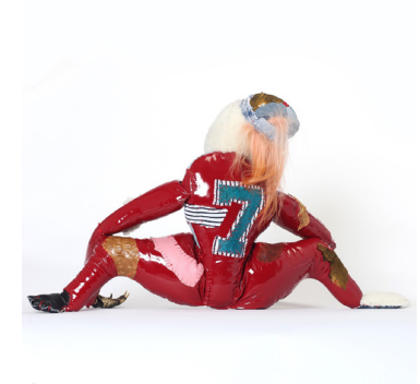
From Left: (all) Gray Wielebinski Sliding Into Home, Wooden baseball bat, sewn leather, fur, baseball cards, jock straps, jersey, 2018. Denim Curtain, Denim, leather, baseball cards, fabric, with champagne glass installation, 2018 Hook, Mixed media soft sculpture (leather, fur, jersey, crocodile hand), 2018