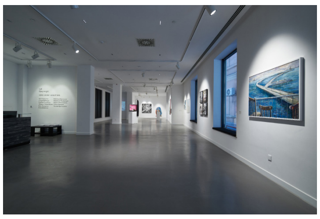
BAKU, 1918, 2018