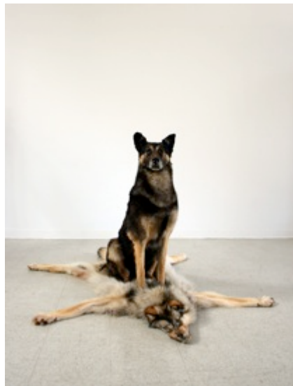
The Progression of regression, 2010 Mike Calway-Fagen Taxidermied German shepherd, old wolf pelt

Mike Calway-Fagen's installations are both humorous and quietly disturbing, featuring taxidermy and subverted found objects arranged to provoke the viewer into building their own story of interpretation. Works on show will include 'Progression of Regression', featuring a taxidermied Alsatian at rest on the flattened and skinned pelt of a wolf. Mike will also make a 'ghost' installation derived from objects found both in and around Belgrave Square, these secret items will be placed in and around the study, their weight leaving an impression on the carpet which will fade from view over the life of the exhibition