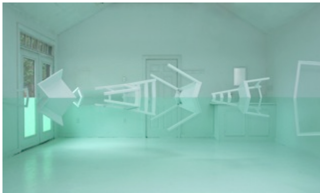
Green House furniture, paint, wire Kyung Woo Han 2009