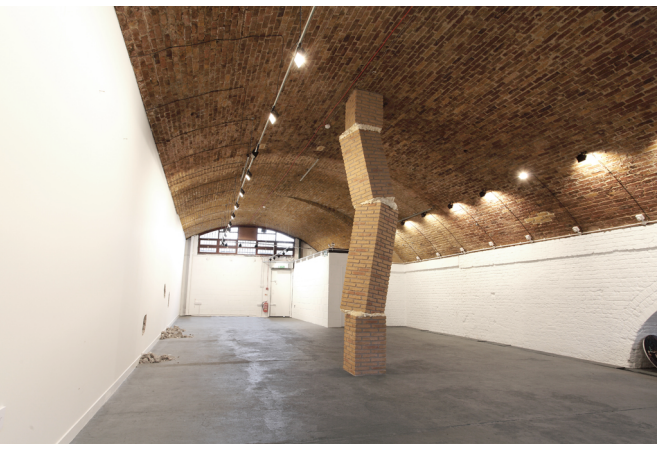
Shan Hur, Broken Pillar (2011)