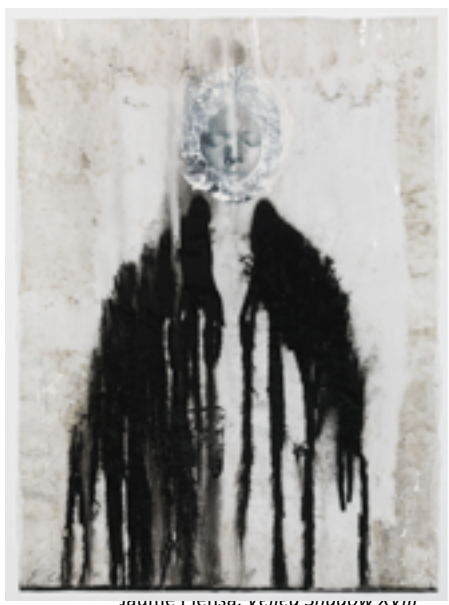
BODHI 15 march – 19 April 2012