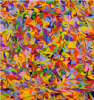
Hyo Myoung Kim, Spectrum Colours Arranged by Chance VII – fingered, 2012

Hyo Myoung Kim creates works that contemplate the connection between pixels in digital images and modern art. Recent technologies such as 'Retina Display' hide the visual base of a grid by making the pixels smaller; however, this illusion breaks down upon closer inspection. What becomes apparent are the rows of rectangular colour blocks – what Kim perceives as a reflection of the visual language of modern art - Cubism, De Stijl and Minimalism. As Kim explains, "From a distance, a digital image could be a Vermeer or Dürer. Up close, it looks like a chance-based painting by Kelly or a Richter painting". These two opposing sides – the real and the antireal – sit together in the same image but only one side can be visually perceived at one time.