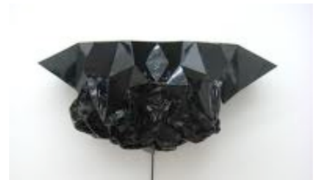
Charlotte Becket, Inkblot , 2009

The work of Charlotte Becket is made from discarded materials (plastic, tape) as well as mechanical components such as the use of a motor. The works are seemingly inanimate objects but close inspection shows them expanding and contracting as if breathing. As Becket states "The repetitiously falling and turning objects occupy an ambiguous state somewhere between hopeful anticipation and banal recurrence, as they mechanically perform tasks that straddle and confuse the boundaries between optimism and futility."