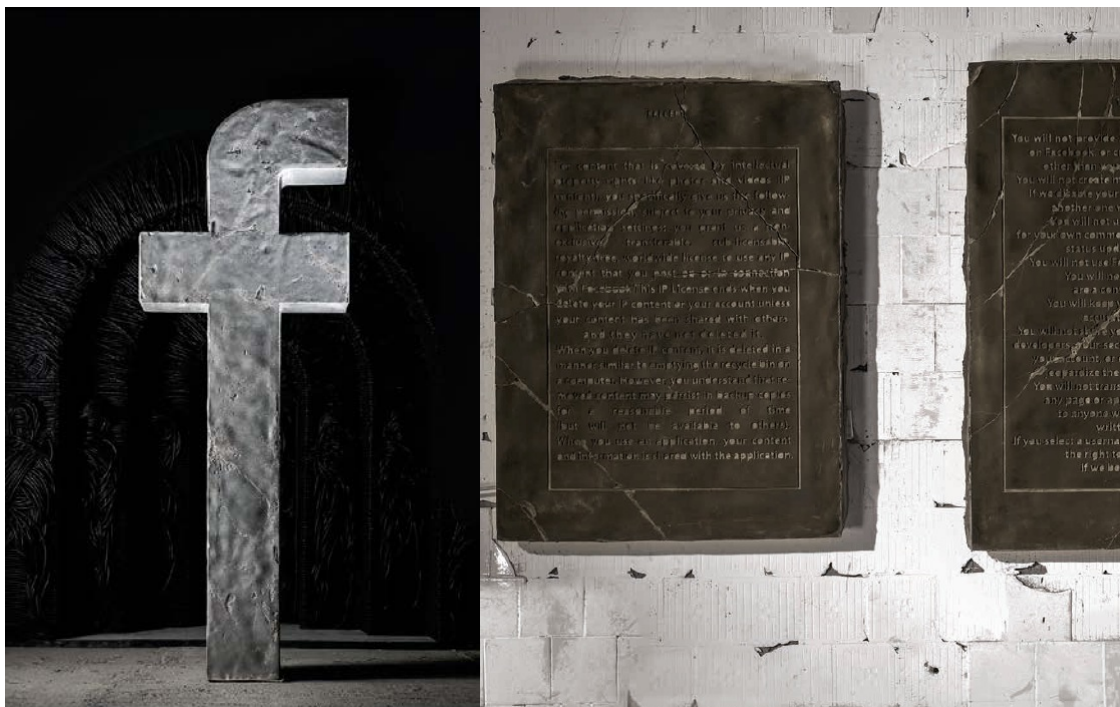
L to R: © Recycle Art Group – F, Tablets , 2012

The common thread running through the exhibition is the human search for perfection and the gulf that exists between these ideals and reality.