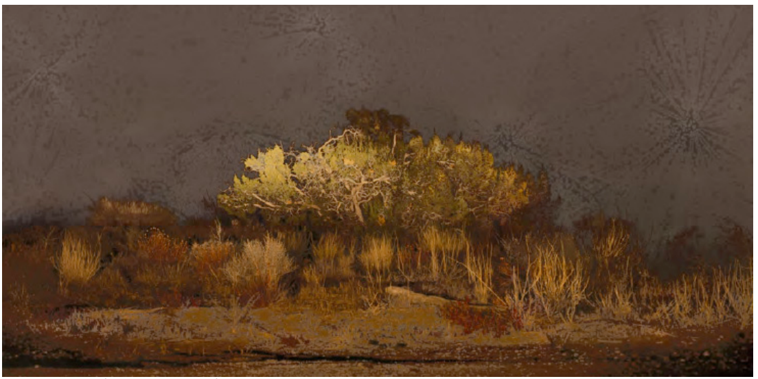
Scenapse #8 (Desert Nocturn) © Aziz + Cucher

Seen together, these two bodies of work evoke feelings of fragility and transience, qualities that are part of both the natural and man-made world.