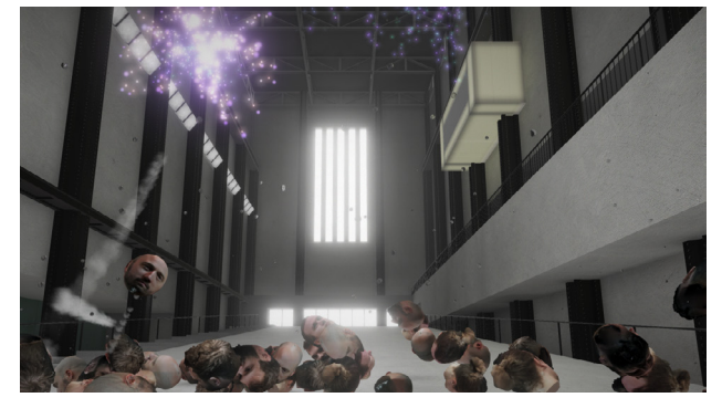
© Mbryonic (Tom Szirtes & Xan Adderley) with Xavier Sole, Appropriation #1: The Sleep of Reason Still Produces Monsters, 2018.

Appropriation #1: The Sleep of Reason Still Produces Monsters is an ongoing project that utilises famous spaces, such as the Turbine Hall at Tate Modern in this case, in order to expand the viewer's imagination and our commonly accepted truths. The Turbine Hall was an industrial space but is now a consecrated one. This is a vital part of the context. What if the roof of the Tate were to fly off? Collapse? Burn? This work entitled, Appropriation #1: The Sleep of Reason Still Produces Monsters is inspired by three works of Francisco Goya's: The Hill of San Isidro, The Pilgrimage of San Isidro, and The Great He-Goat. In the work, the audience witnesses a surreal celebration party of decapitated heads, which evolves and descends into an aggressive assault on the senses.