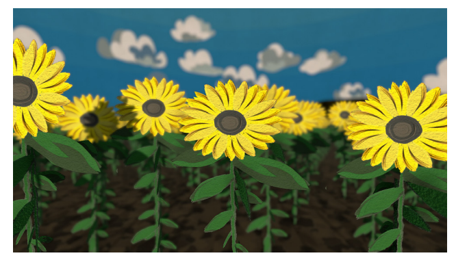
© Mbryonic (Tom Szirtes & Xan Adderley) with Xavier Sole, Sunfollowers, 2018

Sunfollowers is the second work on display from Mbryonic and Xavier Sole. Here, the viewer finds themselves in the middle of a beautiful and lush sunflower field. The relationship between the sun and field are rapidly changing, as the sun burns brighter and stronger with every second. The metaphor of the relationship between followers and followed has clear political resonance. Who is the influencer and who is the influenced? Questions of the relationship between independence and responsibility come up and make us critique how we inhabit our own world.