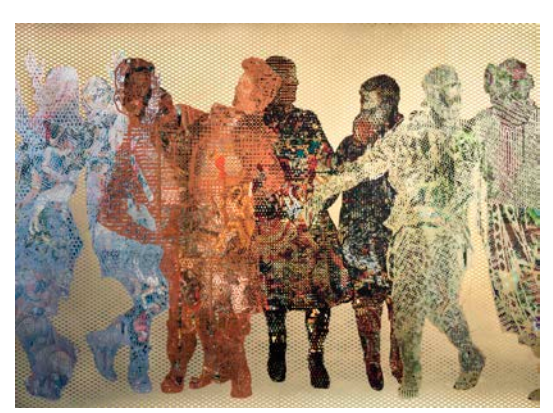
© Aziz + Cucher, Frieze #7, 2018, Inkjet, silk screen and 24K gold leaf or Hahnemühle paper