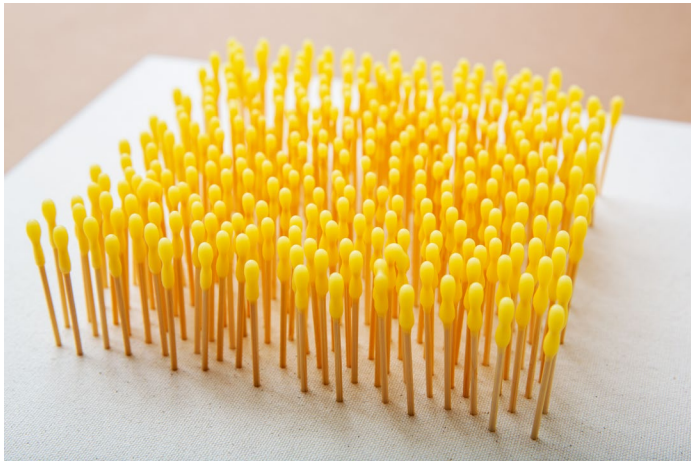
© Alexander Reben, The Final Resting Place of the Queen Bee , 2020.