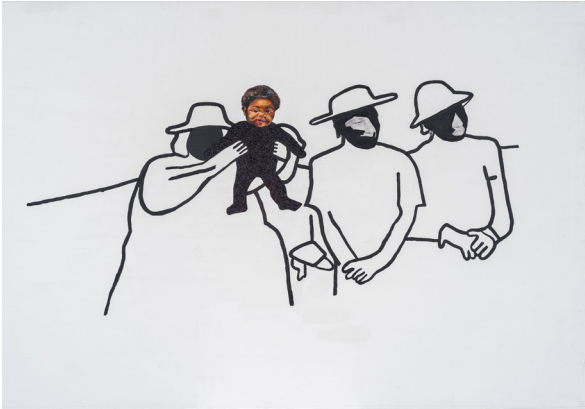
© Khaleb Brooks, Lift Every Voice , 2022